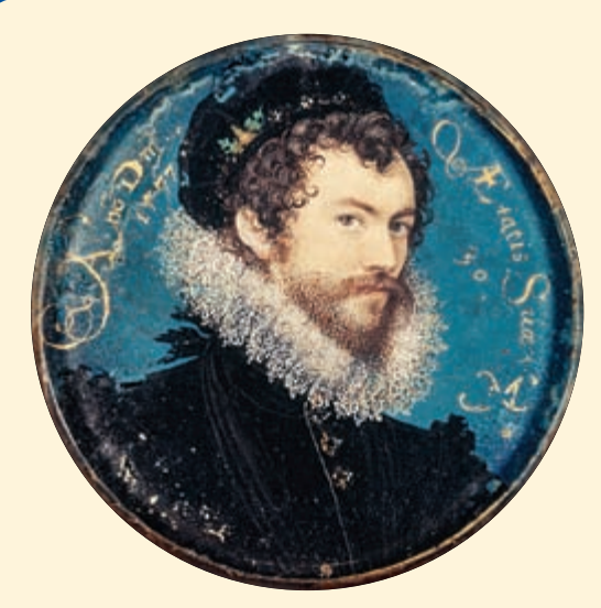
Self-Portrait, Nicholas Hilliard.