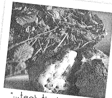
“...took the bread and began to devour it.”

“He collapsed. His fist still clenched around a small piece. He tried to carry it to his mouth. But the other one threw himself upon him and snatched it. The old man again whispered something, let out a rattle, and died amid the general indifference. His son searched him, took the bread and began to devour it. He was not able to get very far. Two men had seen and hurled themselves upon him. Others joined in. When they withdrew, next to me were two corpses, side by side, the father and the son.”