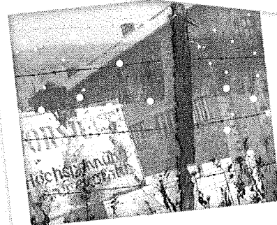
“The snow began to form...”

“The snow began to form a thick layer over our blankets. They brought us bread — the usual ration. We threw ourselves upon it. Someone had the idea of appeasing his thirst by eating the snow. Soon the others were imitating him. As we were not allowed to bend down, everyone took a spoon and ate the accumulated snow off his neighbor’s back. A mouthful of bread and a spoonful of snow. The SS who were watching laughed at the spectacle.”